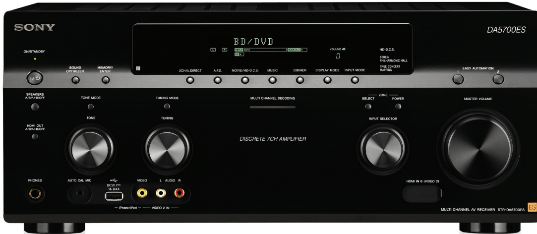
7.2 Channel Network Multi-Room A/V Receiver